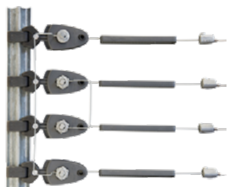
K20 Tensioner Link System