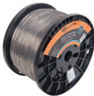
High Conductivity Wire