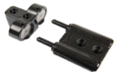
High Voltage Gate Switch